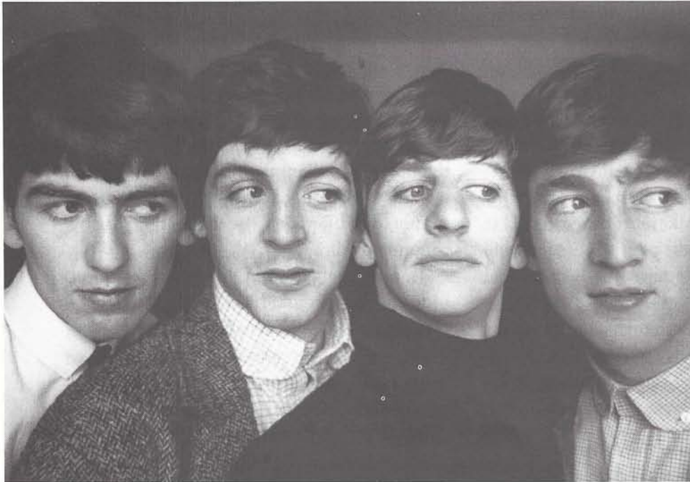
The Young Beatles

The alternative, more correct, sustaining, and sustainable paradigm celebrates the 'Love/528 field theory'. The frequency vibration of 528, as mentioned, holds a very special resonance energy that corresponds to, or with, the heart of creation—that is, the musical mathematical organisation that we call the universe.